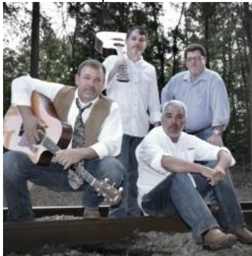
The Reed Brothers - Winner