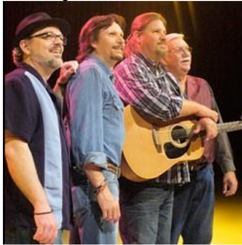
Waymasters - Winner ALL NOMINEES