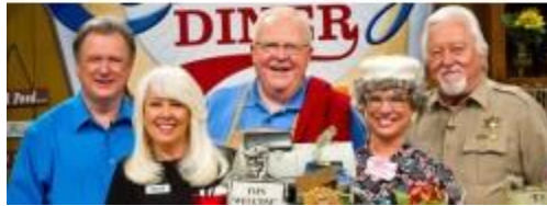
Larry's Country Diner - Winner ALL NOMINEES