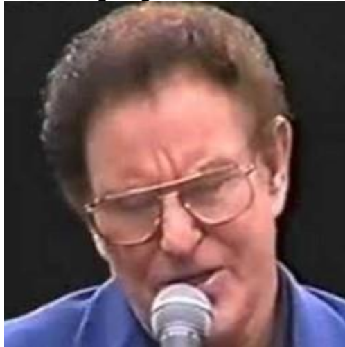
Freddie Hart - Winner ALL NOMINEES